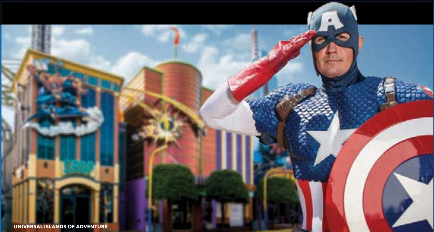
UNIVERSAL ISLANDS OF ADVENTURE

*The 2-Park Military 2024 Freedom Pass Promotional Ticket entitles one (1) guest admission to BOTH Universal Studios Florida, AND Universal Islands of Adventure theme parks on the same day. Ticket is valid for use November 16, 2023 through and including December 20, 2024. Blockout dates apply: December 25, 2023 through and including January 2, 2024; March 25, 2024 through and including March 31, 2024. Ticket expires in full December 20, 2024. The 3-Park Military 2024 Freedom Pass Promotional Ticket entitles one (1) guest admission to Universal Studios Florida, Universal Islands of Adventure, AND Universal Volcano Bay theme parks on the same day. Ticket is valid for use November 16, 2023 through and including December 20, 2024. Blockout dates apply: December 25, 2023 through and including January 2, 2024; March 25, 2024 through and including March 31, 2024. Ticket expires in full December 20, 2024.